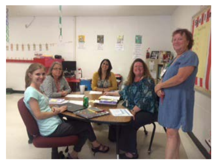
The Kindergarten-2nd grade Instructional Team meets regularly to examine student data and make adjustments to their instruction to meet identified needs.students and school community.

"We are a small district and, when the opportunity for us to rethink our structure emerged, we thought very carefully about what we wanted it to look like. We believed that Lead Hill, despite our elementary and middle/high school structure, could operate more effectively with one principal and an administrative position dedicated to the development of curriculum and instruction.