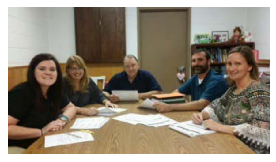
The High School School Improvement Leadership Team has redesigned the principal's job description to reflect the vision they've created for their school.

"We had barely celebrated the news that we were no longer walking the closure plank than we learned we had been designated a focus school at the high school