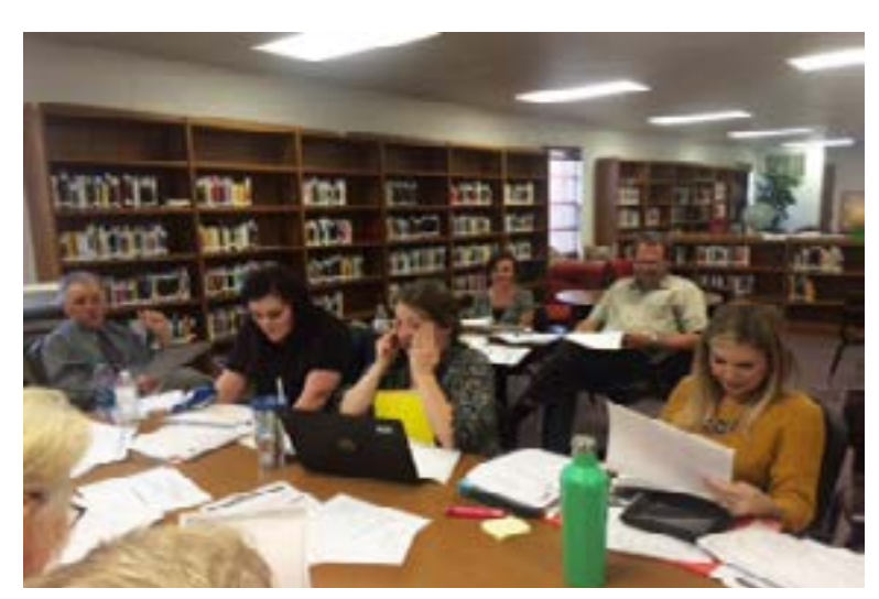
The High School Instructional Team continuously examines their practice to ensure they are not just doing things because they've always been done, but instead are doing things that are right for their students and school community.

"The high turnover rates that we faced year after year as we waited for the closure call resulted in an average of five years of teacher experience in our district. The teachers spoke up to me, their principal, and said, 'We really need someone to support us in delivering instruction to students the way they need it.' And so we began to restructure our entire administrative team based