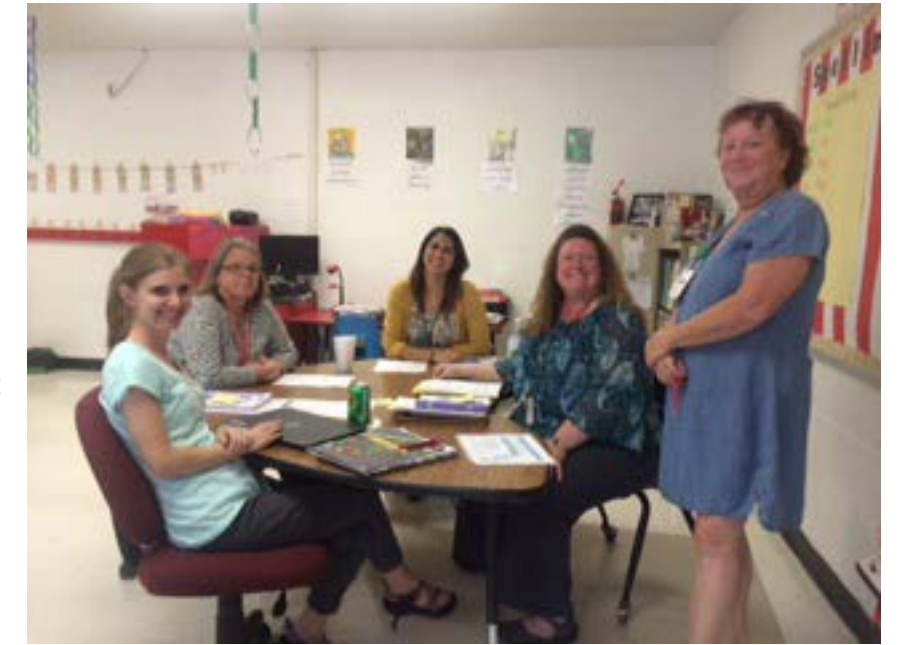
The Kindergarten-2nd grade Instructional Team meets regularly to examine student data and make adjustments to their instruction to meet identified needs, students and school community.

“We are a small district and, when the opportunity for us to rethink our structure emerged, we thought very carefully about what we wanted it to look like. We believed that Lead Hill, despite our elementary and middle/high school structure, could operate more effectively with one principal and an administrative position dedicated to the development of curriculum and instruction.