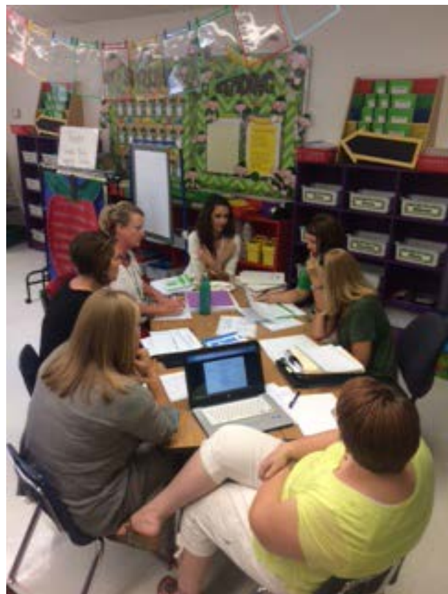
Here the Instructional Team for Grades 2-4 examines lesson plans and student learning data.

“People would ask us, ‘Why are you doing that? Why spend so much time on all of those indicators?’