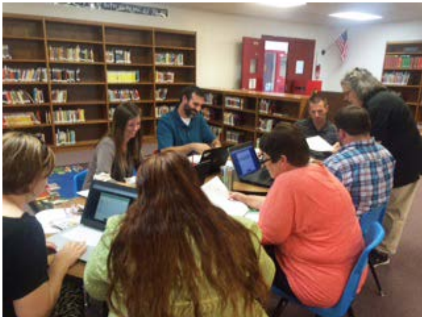
The School Improvement Leadership Team at the Middle School examines the Wise Ways research to plan improvements to their practice.

“We secured resources for substitutes and made it happen with the least to no disruption to students. It is incredible to observe teachers coming to the same realizations that we were coming to: we can stop practices that no longer make sense or that aren’t working at all. Teachers are not spending their time in these meetings planning pep rallies, they are discussing and making decisions about instruction, how we use data, and how we spend our resources to support our priorities.”