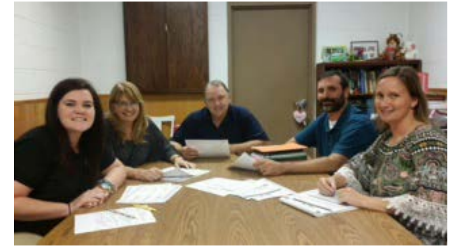
The High School School Improvement Leadership Team has redesigned the principal’s job description to reflect the vision they’ve created for their school.